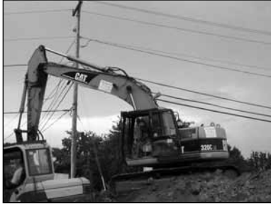
A symbol of the growing season in our industrial community

The Wacker, Whirlpool and Amazon projects are in full swing with construction crews working feverishly to complete their projects on time. Whirlpool and Amazon will be moving equipment into their buildings within the next few months and are already beginning the hiring process. Olin held a groundbreaking ceremony on July 22 for the $160 million conversion of their facilities to new clean technology.