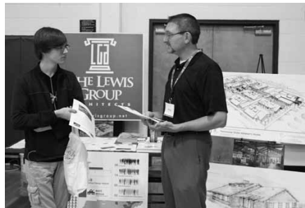
The Lewis Group Architects

Some 800-825 students attended the fair designed to create awareness of what programs are available at their schools and to show them what types of careers are available in Cleveland and Bradley County. Exhibitors also focus on what is required of students to prepare for those careers in secondary and post-secondary education.