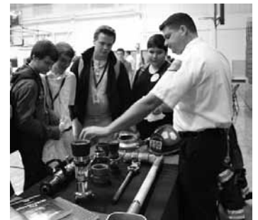
Cleveland Fire Department

Business and industry exhibitors included Cleveland Utilities, Cormetech Environmental Technologies Inc., Family Resource Agency, Franklin Academy, Don Ledford Automotive Center, Lewis Group Architects, Mars Chocolate North America, Olin Corporation, Volkswagen Academy, and WACKER POLYSILICON North America. Representatives from Bradley County Sheriff's Office, Bradley County Fire and Rescue, Cleveland Fire Department and Tennessee Wildlife Resource Agency were also on hand.